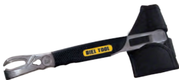
Biel Tool and Sheath Length: 15.1 in 38.3 cm Net Weight: 3.4 lb 1.5 kg Part No. 22-000551